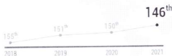
2021 QS Global University Ranking